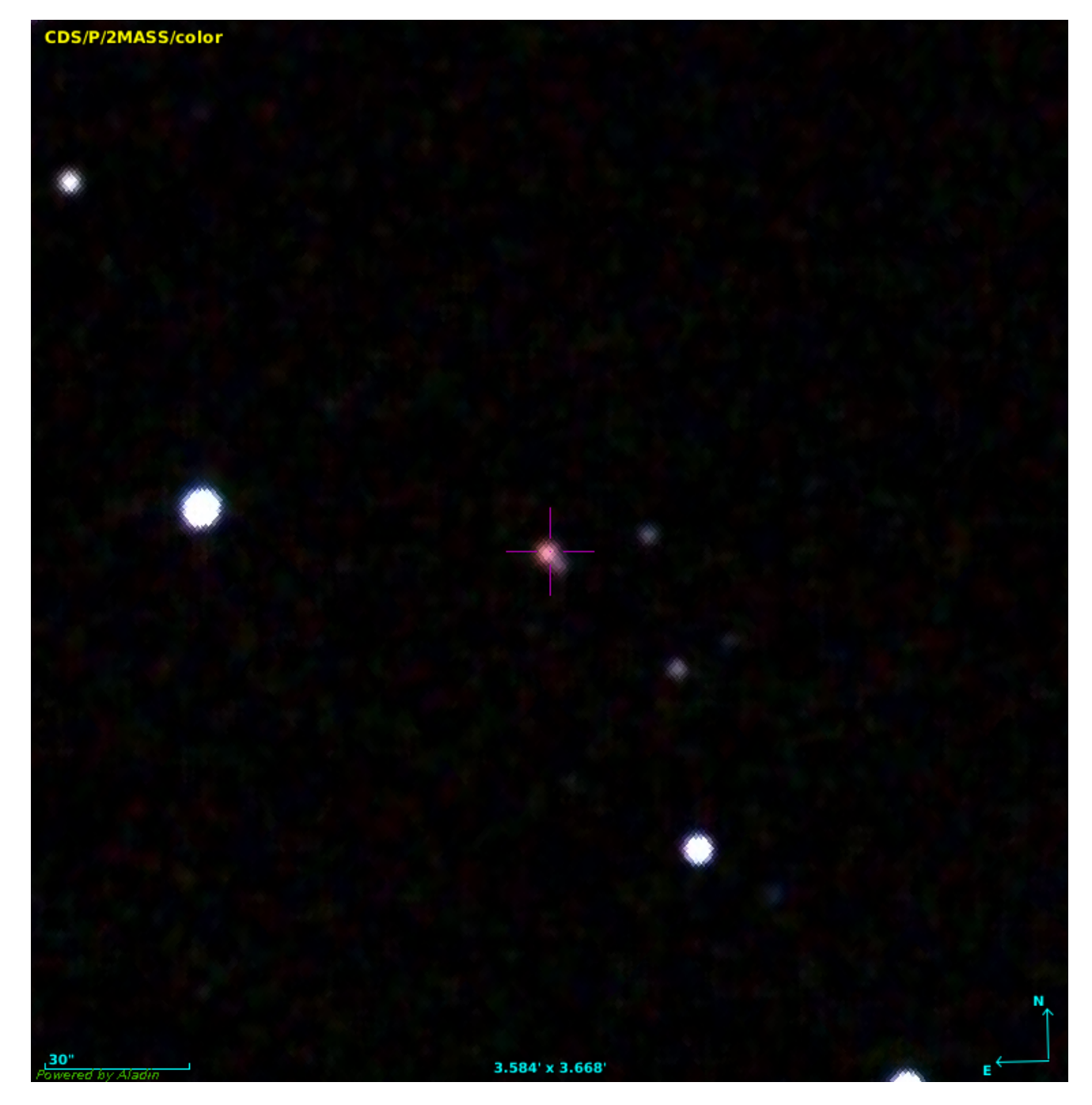
Fig.1 A false-color infrared image of FBQS J161047.7+330337. The blue, green, and red colors correspond to the J, H and K bands respectively. This image was obtained as a part of the Two Micron All Sky Survey (2MASS), a joint project of the University of Massachusetts and the Infrared Processing and Analysis Center/California Institute of Technology, funded by the National Aeronautics and Space Administration and the National Science Foundation.