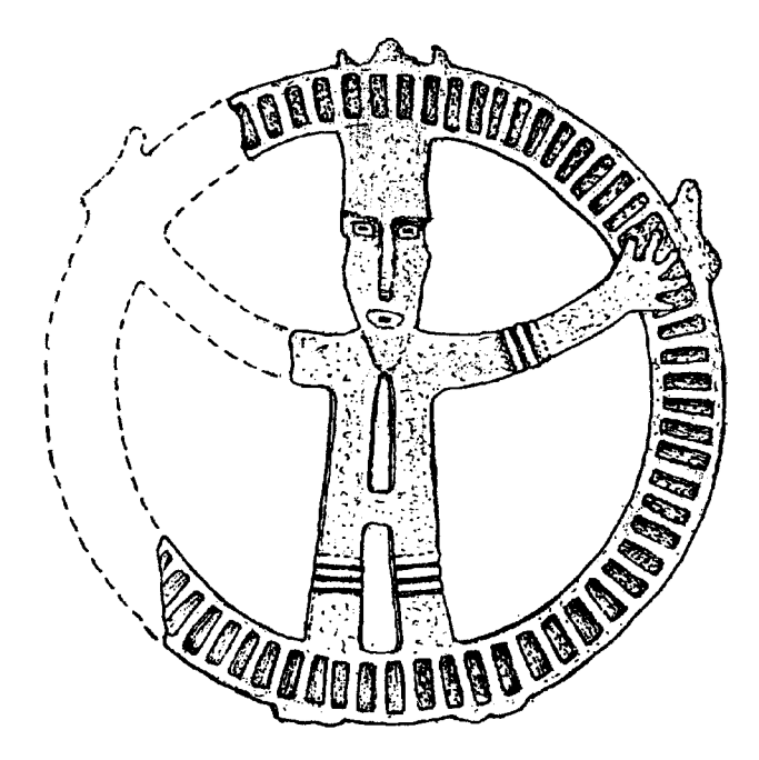
Figure 2 Shaman in the system of the Universe. Cult bronze casting. About 5th century BC Napas river, Tomsk oblast. Kulai culture.