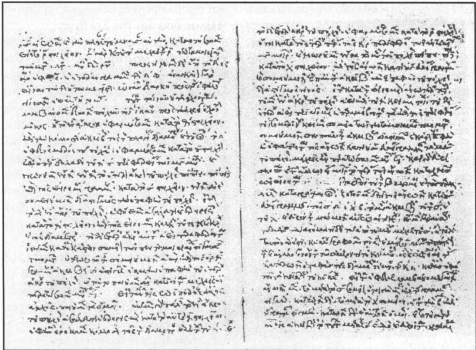
Figure 5. From Codex Vaticanus Gr. 318, sheet 146n–147r: N. Gregoras, ‘How an astrolabe should be constructed’.

astronomy’, ‘How an astrolabe should be constructed’ (figures 4 and 5) and others. As an astronomer, he is superior to those who were studying astronomy in his epoch, in both the East and the West.