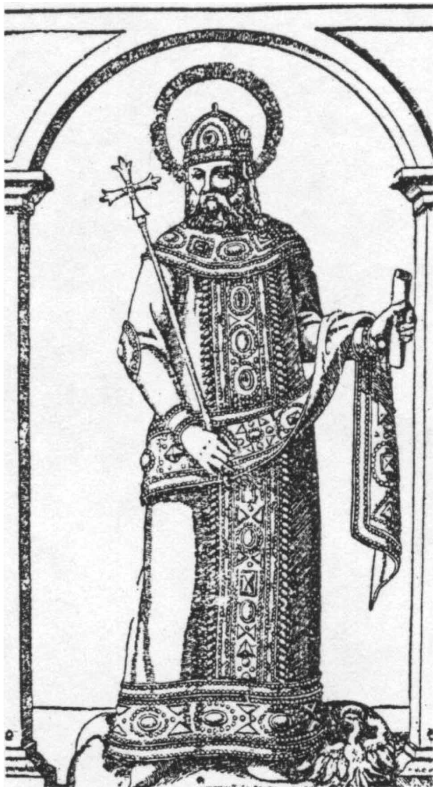
Figure 1. The Emperor Andronicus II Palaeologus.