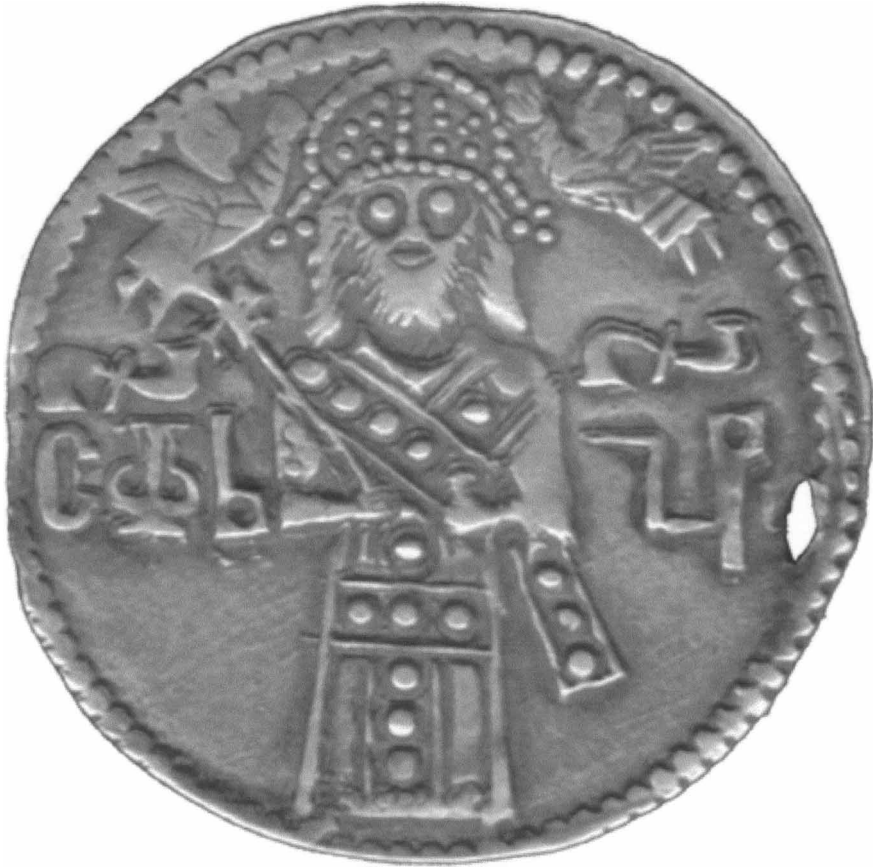
Figure 3. Dinar of the Emperor of Serbs and Greeks Dušan from the collection of Dimitrijević [3]. On this so-called ‘coronation dinar’, issued after the coronation of Stefan Dušan as the Emperor of Serbs and Greeks (Imperator Rascianorum et Romaiorum or Βασιλεὺς καὶ αυτοκράτωρ Σερβίας καὶ Ρωμανίας) on 16 April 1346 in Skoplje, one can see two angels putting the imperial crown (stema) on his head. The Cyrillic inscription says S[TE]F[AN] C[A]R—STEFAN THE EMPEROR.